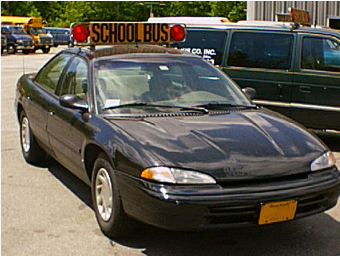
Figure 1: Examples of 7D Vehicles