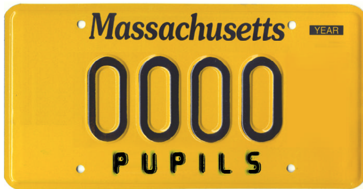
Figure 3: Sample 7D Pupil Plate

Note: You will not receive notification if the RMV does not have your correct mailing address. If you have recently relocated, you must notify the RMV by calling the RMV Phone Center at: 857-368-8000.